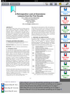
(a) gsBooks Interface